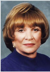
Sen. Gwen Margolis