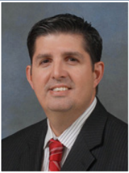
Rep. Manny Diaz, Jr.