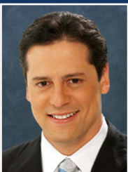
Sen. Miguel Diaz de la Portilla