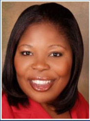
Rep. Daphne Campbell