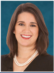
Sen. Anitere Flores