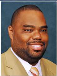
Sen. Dwight Bullard